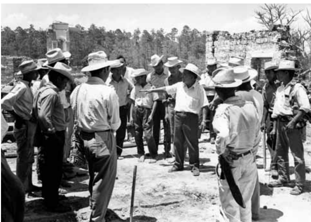
Earthquake resistant training in Guatemala.

Housing materials were distributed, and training and advice provided through locally-hired teams. The aim of this was to accelerate reconstruction, and provide community-wide training on seismic-resistant construction techniques.