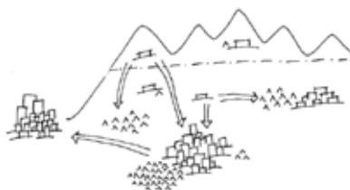
Earthquake strikes. Many people stay, some people move from mountains, to regional cities and to larger cities. Some are forced to live in camps.