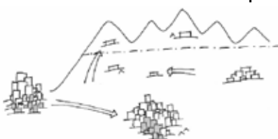
Over the course of several years, people reconstruct their houses and return, although some people remain permanently displaced